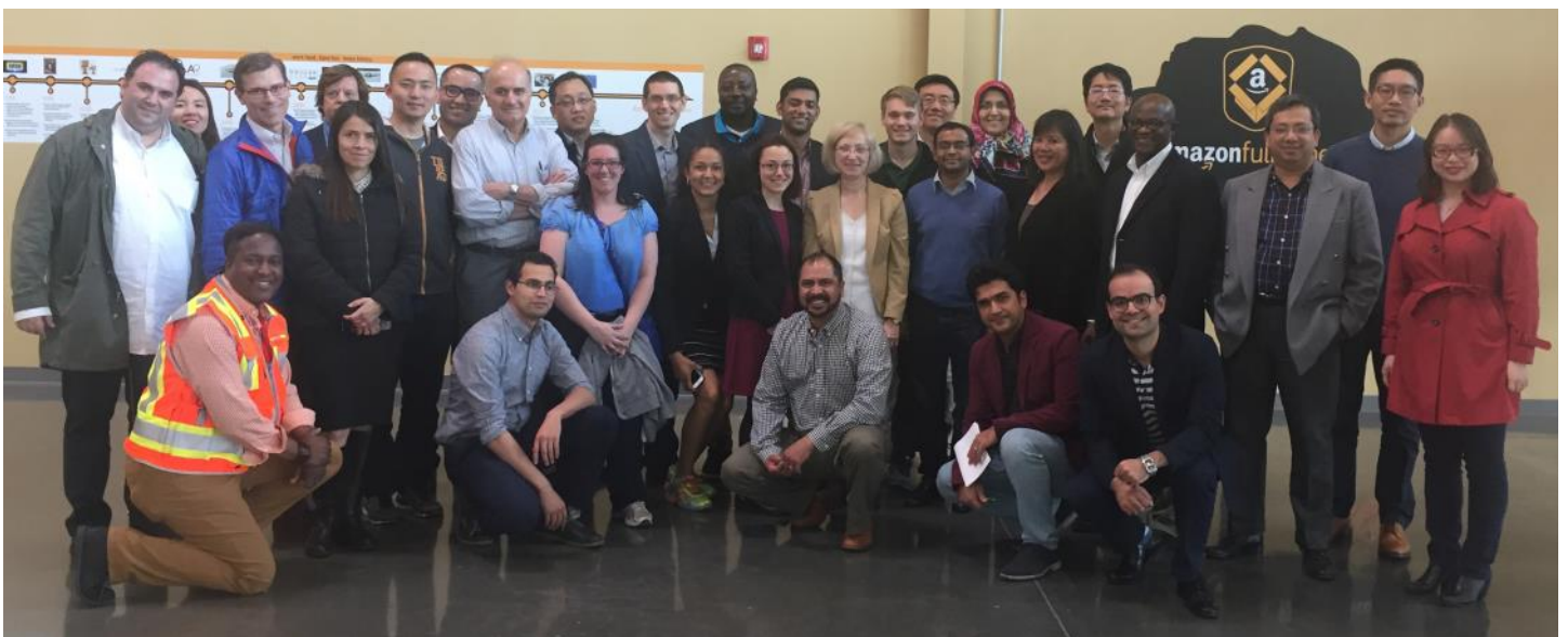
Tour of an Amazon Fulfillment Center by Members of the College of Service Operations, Kent, WA, Friday May 5, 2017